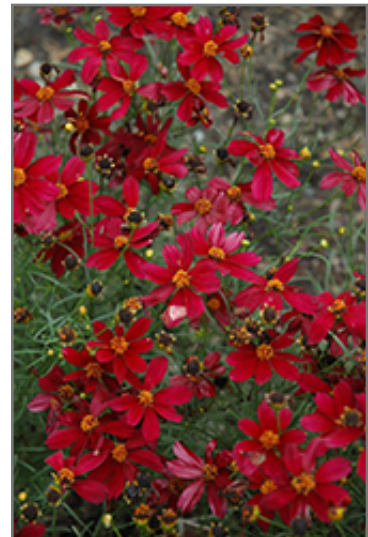
Red Satin Tickseed in bloom