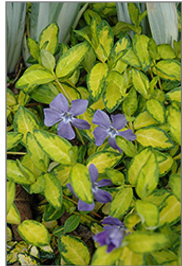
Illumination Periwinkle flowers

Illumination Periwinkle is a fine choice for the garden, but it is also a good selection for planting in outdoor pots and containers. Because of its spreading habit of growth, it is ideally suited for use as a 'spiller' in the 'spiller-thriller-filler' container combination; plant it near the edges where it can spill gracefully over the pot. Note that when growing plants in outdoor containers and baskets, they may require more frequent waterings than they would in the yard or garden.