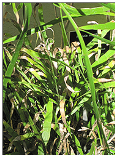
Ribbon Bush

Ribbon Bush will grow to be about 8 feet tall at maturity, with a spread of 8 feet. It tends to fill out right to the ground and therefore doesn't necessarily require facer plants in front, and is suitable for planting under power lines. It grows at a medium rate, and under ideal conditions can be expected to live for approximately 20 years.