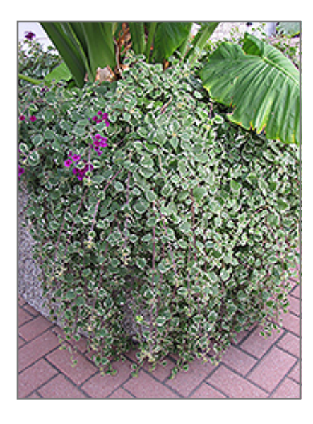
Swedish Ivy