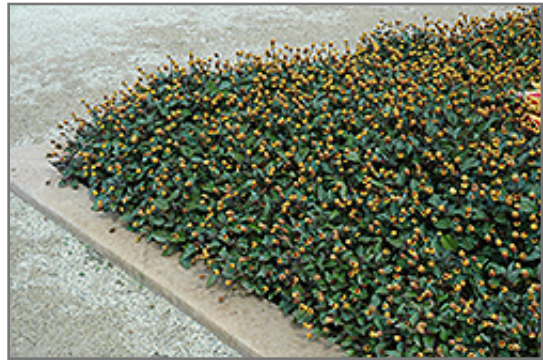
Peek A Boo Para Cress in bloom