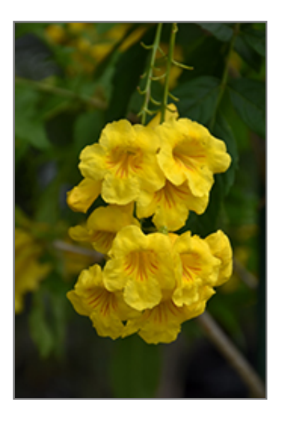
Yellow Trumpetbush flowers

This plant will require occasional maintenance and upkeep, and should only be pruned after flowering to avoid removing any of the current season's flowers. It is a good choice for attracting bees, butterflies and hummingbirds to your yard, but is not particularly attractive to deer who tend to leave it alone in favor of tastier treats. It has no significant negative characteristics.