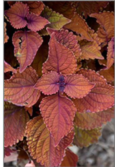
Wall Street Coleus foliage