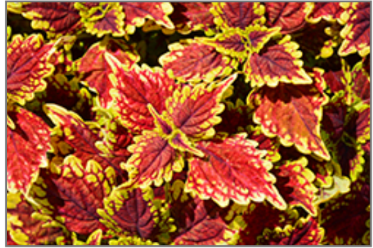
Oxford Street Coleus foliage