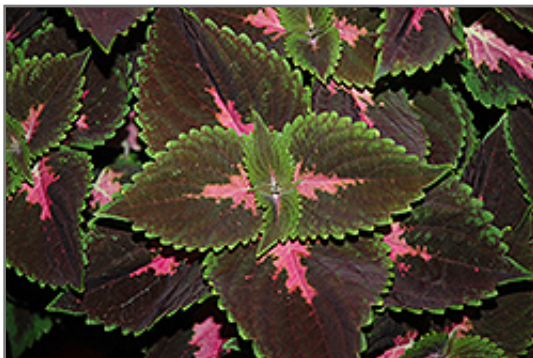
Fifth Avenue Coleus foliage

Fifth Avenue Coleus' attractive serrated pointy leaves emerge green in spring, turning brown in color with showy pink variegation and tinges of green the rest of the year on a plant with an upright spreading habit of growth.