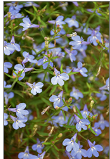
Techno Light Blue Lobelia flowers

Techno Light Blue Lobelia will grow to be about 8 inches tall at maturity, with a spread of 12 inches. When grown in masses or used as a bedding plant, individual plants should be spaced approximately 10 inches apart. Its foliage tends to remain low and dense right to the ground. Although it's not a true annual, this fast-growing plant can be expected to behave as an annual in our climate if left outdoors over the winter, usually needing replacement the following year. As such, gardeners should take into consideration that it will perform differently than it would in its native habitat.