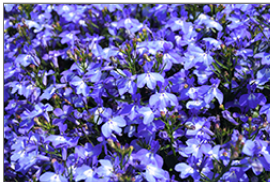
Techno Light Blue Lobelia flowers

Techno Light Blue Lobelia is recommended for the following landscape applications;