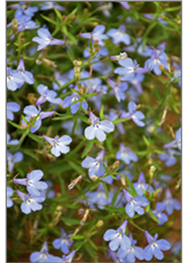
Techno Light Blue Lobelia flowers

Techno Light Blue Lobelia will grow to be about 8 inches tall at maturity, with a spread of 12 inches. When grown in masses or used as a bedding plant, individual plants should be spaced approximately 10 inches apart. Its foliage tends to remain low and dense right to the ground. Although it's not a true annual, this fast-growing plant can be expected to behave as an annual in our climate if left outdoors over the winter, usually needing replacement the following year. As such, gardeners should take into consideration that it will perform differently than it would in its native habitat.