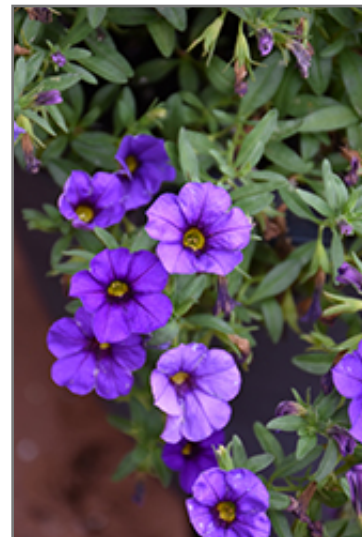
Aloha Kona Midnight Blue Calibrachoa flowers

Aloha Kona Midnight Blue Calibrachoa is recommended for the following landscape applications;