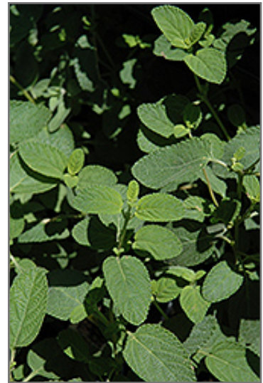
Mexican Oregano foliage