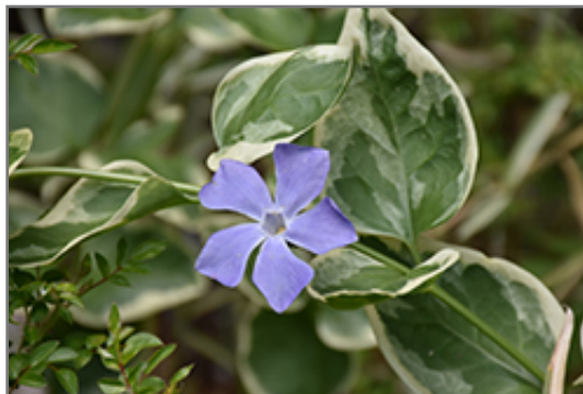
Variegated Periwinkle flowers