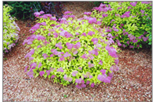
Goldmound Spirea in bloom

This shrub should only be grown in full sunlight. It prefers to grow in average to moist conditions, and shouldn't be allowed to dry out. It is not particular as to soil type or pH. It is highly tolerant of urban pollution and will even thrive in inner city environments. This is a selected variety of a species not originally from North America.