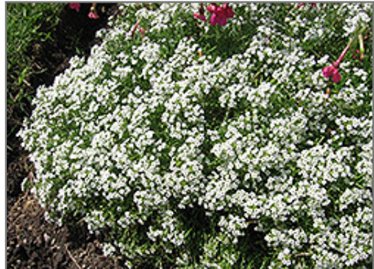
Wonderland White Alyssum in bloom