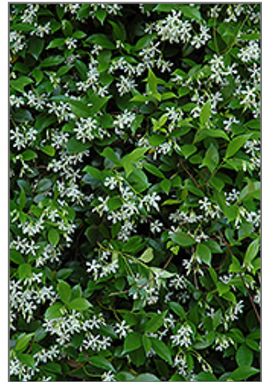
Confederate Star-Jasmine flowers