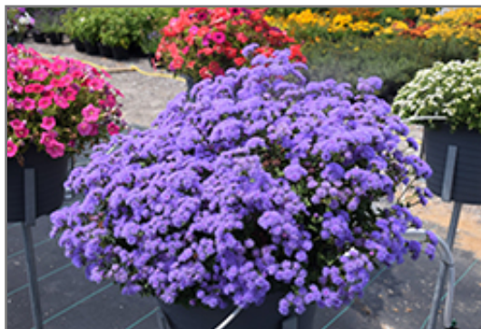
Artist Blue Flossflower in bloom