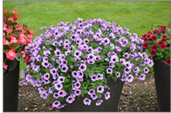
Supertunia Bordeaux Petunia in bloom

Supertunia Bordeaux Petunia is a fine choice for the garden, but it is also a good selection for planting in outdoor containers and hanging baskets. Because of its trailing habit of growth, it is ideally suited for use as a 'spiller' in the 'spiller-thriller-filler' container combination; plant it near the edges where it can spill gracefully over the pot. Note that when growing plants in outdoor containers and baskets, they may require more frequent waterings than they would in the yard or garden.