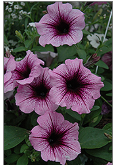
Supertunia Bordeaux Petunia flowers