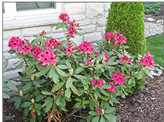
Nova Zembla Rhododendron in bloom