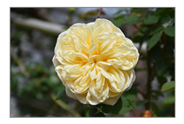
Teasing Georgia Rose flowers