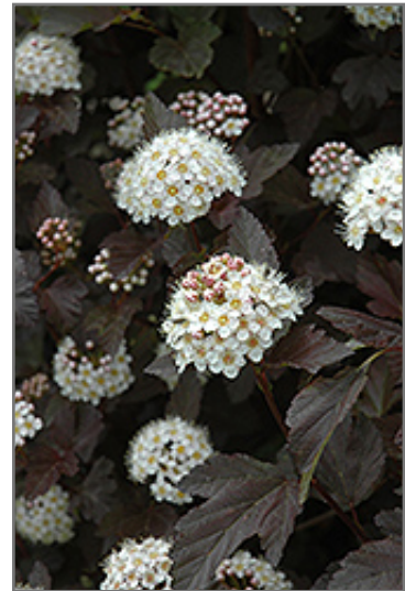
Diablo Ninebark flowers

Diablo Ninebark is recommended for the following landscape applications;