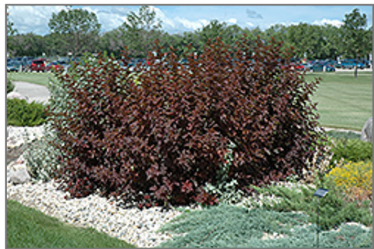
Diablo Ninebark