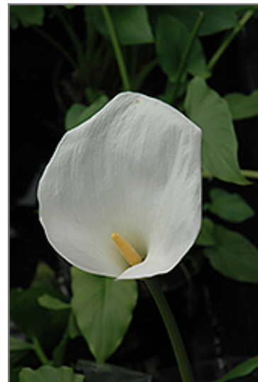
Calla Lily flowers