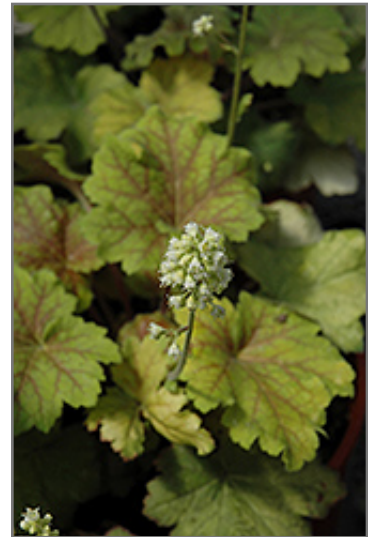
Electra Coral Bells flowers

Electra Coral Bells is recommended for the following landscape applications;