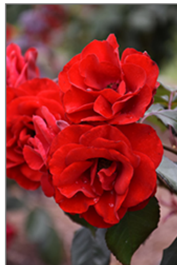
Europeana Rose flowers

The Europeana Rose is recommended for the following landscape applications;