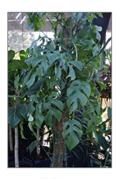
Mini Monstera

When grown indoors, Mini Monstera can be expected to grow to be about 12 feet tall at maturity, with a spread of 3 feet. It grows at a medium rate, and under ideal conditions can be expected to live for approximately 20 years. This houseplant performs well in both bright or indirect sunlight and strong artificial light, and can therefore be situated in almost any well-lit room or location. It is very adaptable to both dry and moist soil, but will not tolerate any standing water. The surface of the soil shouldn't be allowed to dry out completely, and so you should expect to water this plant once and possibly even twice each week. Be aware that your particular watering schedule may vary depending on its location in the room, the pot size, plant size and other conditions; if in doubt, ask one of our experts in the store for advice. It will benefit from a regular feeding with a general-purpose fertilizer with every second or third watering. It is not particular as to soil type or pH; an average potting soil should work just fine. Be warned that parts of this plant are known to be toxic to humans and animals, so special care should be exercised if growing it around children and pets.