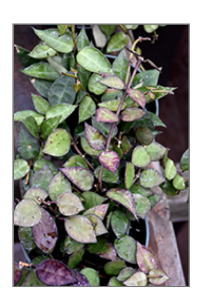
Hoya Krohniana foliage

When grown indoors, Hoya Krohniana can be expected to grow to be about 6 feet tall at maturity, with a spread of 24 inches. It grows at a medium rate, and under ideal conditions can be expected to live for approximately 10 years. This houseplant should be situated in a location that that gets indirect sunlight at most, although it will usually require a more brightly-lit environment than what artificial indoor lighting alone can provide. It is very adaptable to both dry and moist soil, but will not tolerate any standing water. The surface of the soil shouldn't be allowed to dry out completely, and so you should expect to water this plant once and possibly even twice each week. Be aware that your particular watering schedule may vary depending on its location in the room, the pot size, plant size and other conditions; if in doubt, ask one of our experts in the store for advice. It is not particular as to soil pH, but grows best in rich soil. Contact the store for specific recommendations on pre-mixed potting soil for this plant.