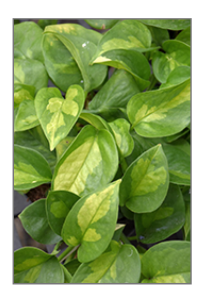
Global Green Pothos foliage

When grown indoors, Global Green Pothos can be expected to grow to be about 5 feet tall at maturity, with a spread of 24 inches. It grows at a fast rate, and under ideal conditions can be expected to live for approximately 10 years. This houseplant performs well in both bright or indirect sunlight and strong artificial light, and can therefore be situated in almost any well-lit room or location. It does best in average to evenly moist soil, but will not tolerate standing water. The surface of the soil shouldn't be allowed to dry out completely, and so you should expect to water this plant once and possibly even twice each week. Be aware that your particular watering schedule may vary depending on its location in the room, the pot size, plant size and other conditions; if in doubt, ask one of our experts in the store for advice. It is not particular as to soil type or pH; an average potting soil should work just fine. Be warned that parts of this plant are known to be toxic to humans and animals, so special care should be exercised if growing it around children and pets.