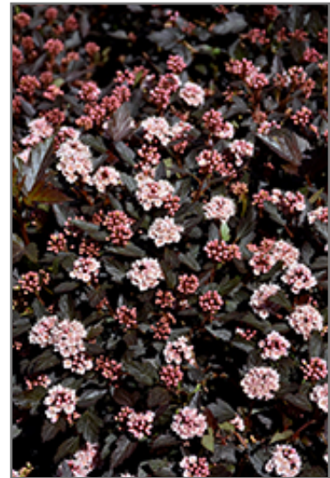
Little Joker Ninebark flowers