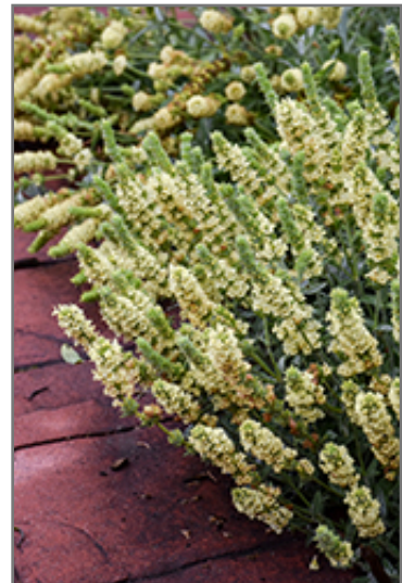
Ironwort flowers