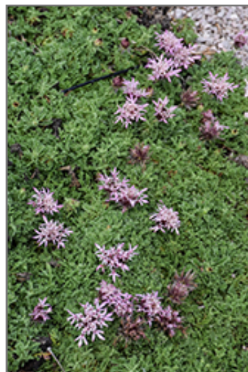
Carpeting Pincushion Flower in bloom

Carpeting Pincushion Flower is a dense herbaceous evergreen perennial with a ground-hugging habit of growth. It brings an extremely fine and delicate texture to the garden composition and should be used to full effect.