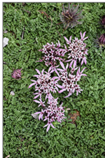
Carpeting Pincushion Flower flowers