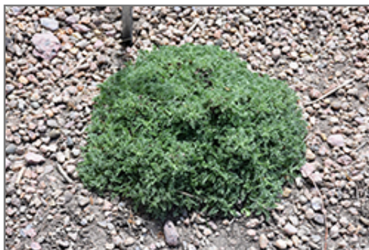
Carpeting Pincushion Flower