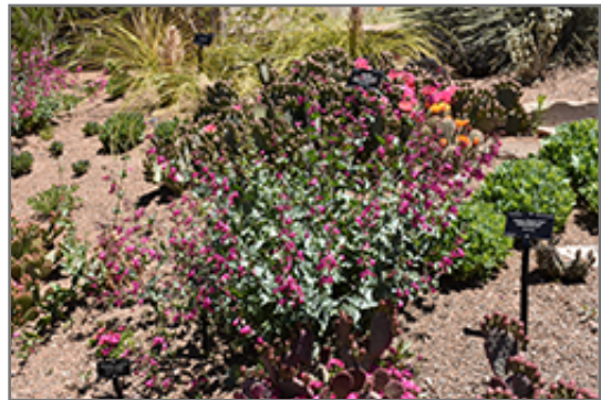
Desert Beard Tongue in bloom