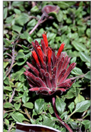
Marian Sampson Scarlet Monardella flowers

This is a relatively low maintenance plant, and should not require much pruning, except when necessary, such as to remove dieback. It is a good choice for attracting hummingbirds to your yard. It has no significant negative characteristics.