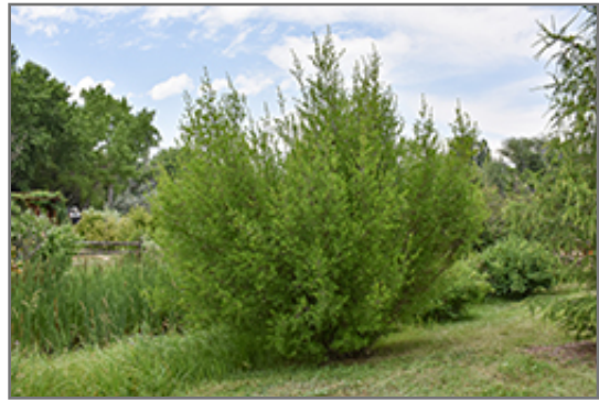
New Mexico Privet