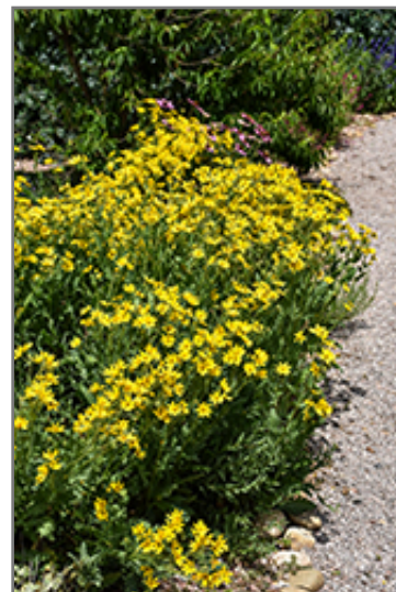
Engelmann's Daisy in bloom