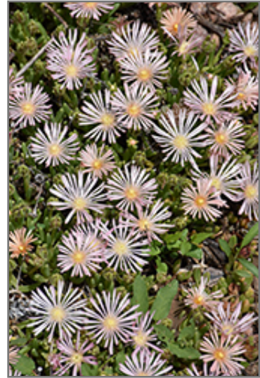
Alan's Apricot Ice Plant flowers