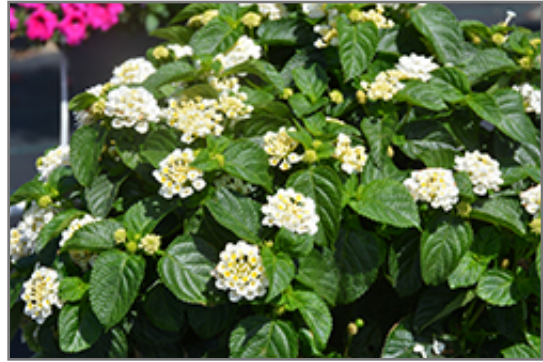
Havana Full Moon Lantana flowers

Havana Full Moon Lantana will grow to be about 18 inches tall at maturity, with a spread of 18 inches. When grown in masses or used as a bedding plant, individual plants should be spaced approximately 14 inches apart. Although it's not a true annual, this fast-growing plant can be expected to behave as an annual in our climate if left outdoors over the winter, usually needing replacement the following year. As such, gardeners should take into consideration that it will perform differently than it would in its native habitat.