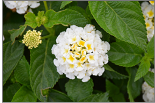
Havana Full Moon Lantana flowers

This is a relatively low maintenance plant, and should not require much pruning, except when necessary, such as to remove dieback. It is a good choice for attracting butterflies and hummingbirds to your yard, but is not particularly attractive to deer who tend to leave it alone in favor of tastier treats. It has no significant negative characteristics.