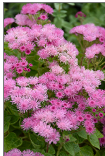
Bumble Rose Flossflower flowers

Bumble Rose Flossflower is recommended for the following landscape applications;