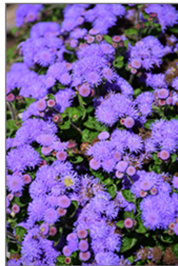
Bumble Blue Flossflower flowers