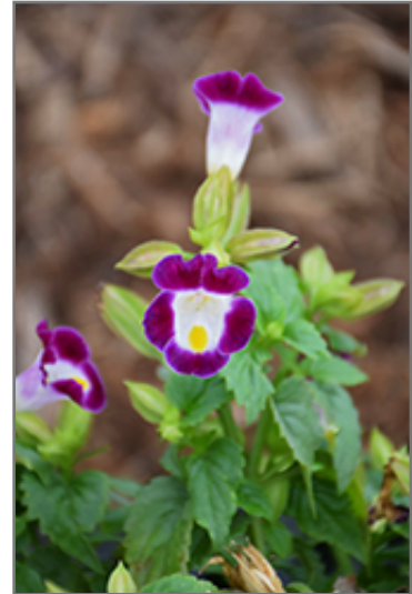
Kauai Burgundy Torenia flowers

Kauai Burgundy Torenia is recommended for the following landscape applications;