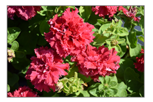
Double Cascade Valentine Petunia flowers