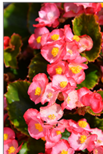
Ambassador Rose Blush Begonia flowers