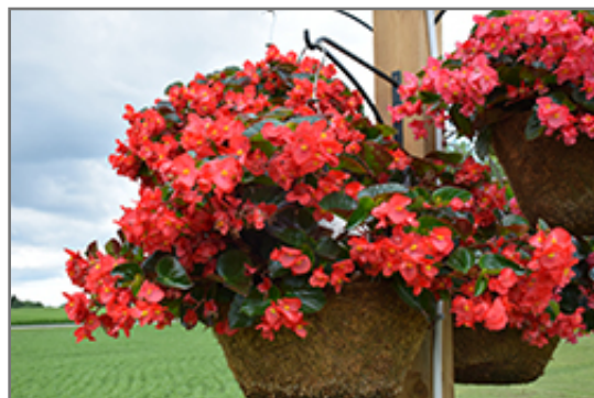
Viking Explorer Red on Green Begonia in bloom