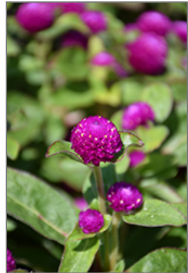
Gnome Purple Gomphrena flowers

Gnome Purple Gomphrena is recommended for the following landscape applications;