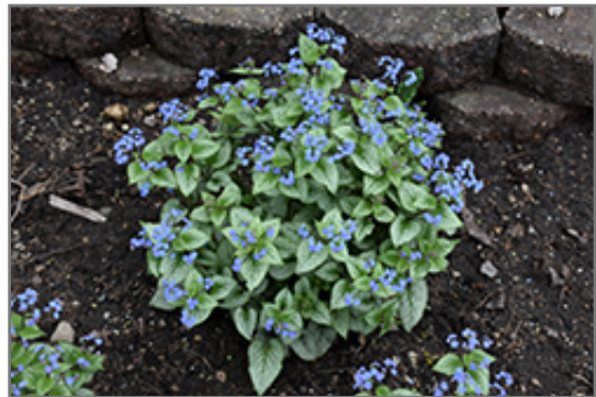
Sterling Silver Bugloss in bloom