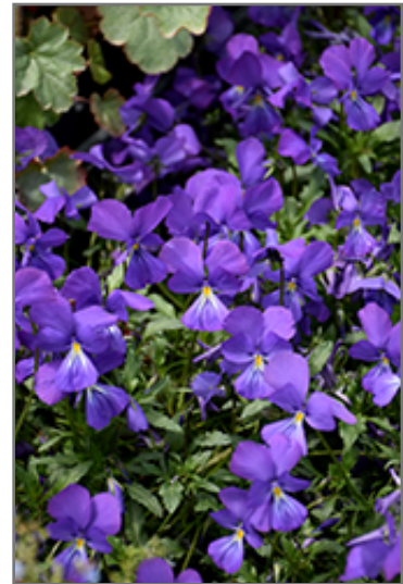
Corsican Pansy flowers

Corsican Pansy is recommended for the following landscape applications;