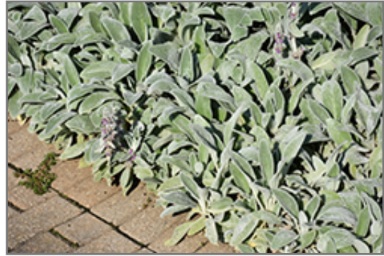
Lamb's Ears

Lamb's Ears will grow to be about 12 inches tall at maturity extending to 24 inches tall with the flowers, with a spread of 18 inches. When grown in masses or used as a bedding plant, individual plants should be spaced approximately 15 inches apart. Its foliage tends to remain dense right to the ground, not requiring facer plants in front. It grows at a fast rate, and under ideal conditions can be expected to live for approximately 10 years. As an herbaceous perennial, this plant will usually die back to the crown each winter, and will regrow from the base each spring. Be careful not to disturb the crown in late winter when it may not be readily seen!