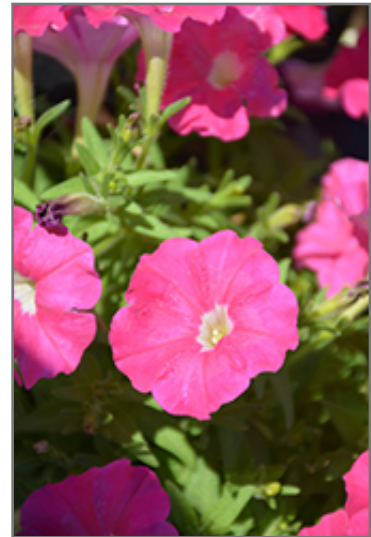
Picobella Pink Petunia flowers

Picobella Pink Petunia is recommended for the following landscape applications;