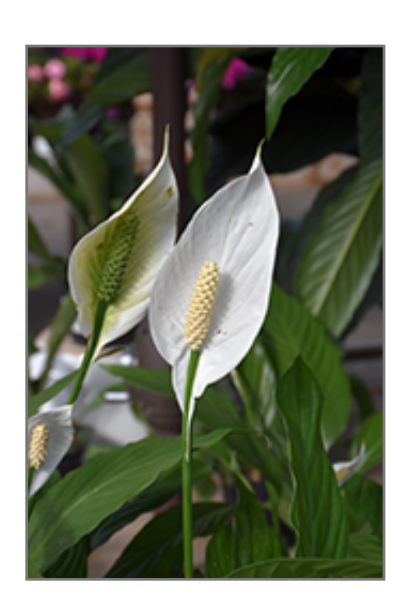
Peace Lily flowers

When grown indoors, Peace Lily can be expected to grow to be about 30 inches tall at maturity, with a spread of 30 inches. It grows at a medium rate, and under ideal conditions can be expected to live for approximately 10 years. This houseplant performs well in both bright or indirect sunlight and strong artificial light, and can therefore be situated in almost any well-lit room or location. It prefers to grow in average to moist soil. The surface of the soil shouldn't be allowed to dry out completely, and so you should expect to water this plant once and possibly even twice each week. Be aware that your particular watering schedule may vary depending on its location in the room, the pot size, plant size and other conditions; if in doubt, ask one of our experts in the store for advice. It is particular about its soil conditions, with a strong preference for rich, acidic soil. Contact the store for specific recommendations on pre-mixed potting soil for this plant. Be warned that parts of this plant are known to be toxic to humans and animals, so special care should be exercised if growing it around children and pets.