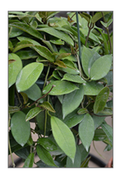
Wax Plant foliage

When grown indoors, Wax Plant can be expected to grow to be about 10 inches tall at maturity, with a spread of 4 feet. It grows at a medium rate, and under ideal conditions can be expected to live for approximately 10 years. This houseplant performs well in both bright or indirect sunlight and strong artificial light, and can therefore be situated in almost any well-lit room or location. It is very adaptable to both dry and moist soil, but will not tolerate any standing water. The surface of the soil shouldn't be allowed to dry out completely, and so you should expect to water this plant once and possibly even twice each week. Be aware that your particular watering schedule may vary depending on its location in the room, the pot size, plant size and other conditions; if in doubt, ask one of our experts in the store for advice. It is particular about its soil conditions, with a strong preference for rich, acidic soil. Contact the store for specific recommendations on pre-mixed potting soil for this plant.