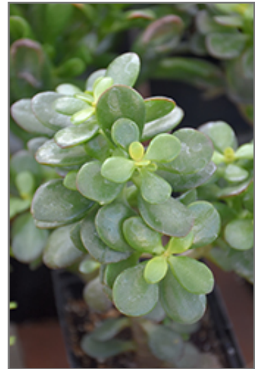
Baby Jade Plant foliage

This is a multi-stemmed evergreen houseplant with an upright spreading habit of growth. This plant can be pruned at any time to keep it looking its best.